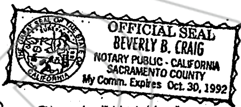
(This area for official notarial seal)