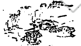
EXHIBIT "A" REQUESTED BY Stewart Title of Douglas County IN OFFICIAL RECORDS OF DOUGLAS CO., NEVADA