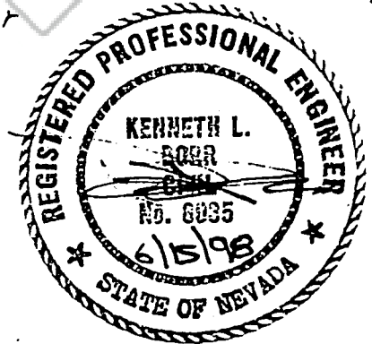
ENGINEER'S SEAL (Sign and Date)