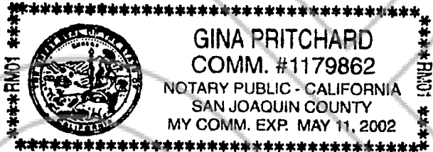
(This area for official notarial seal)