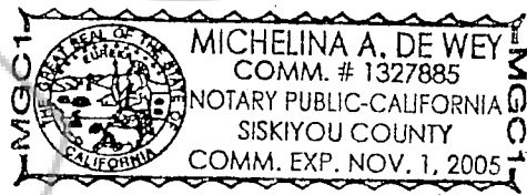
(This area for official notarial seal)