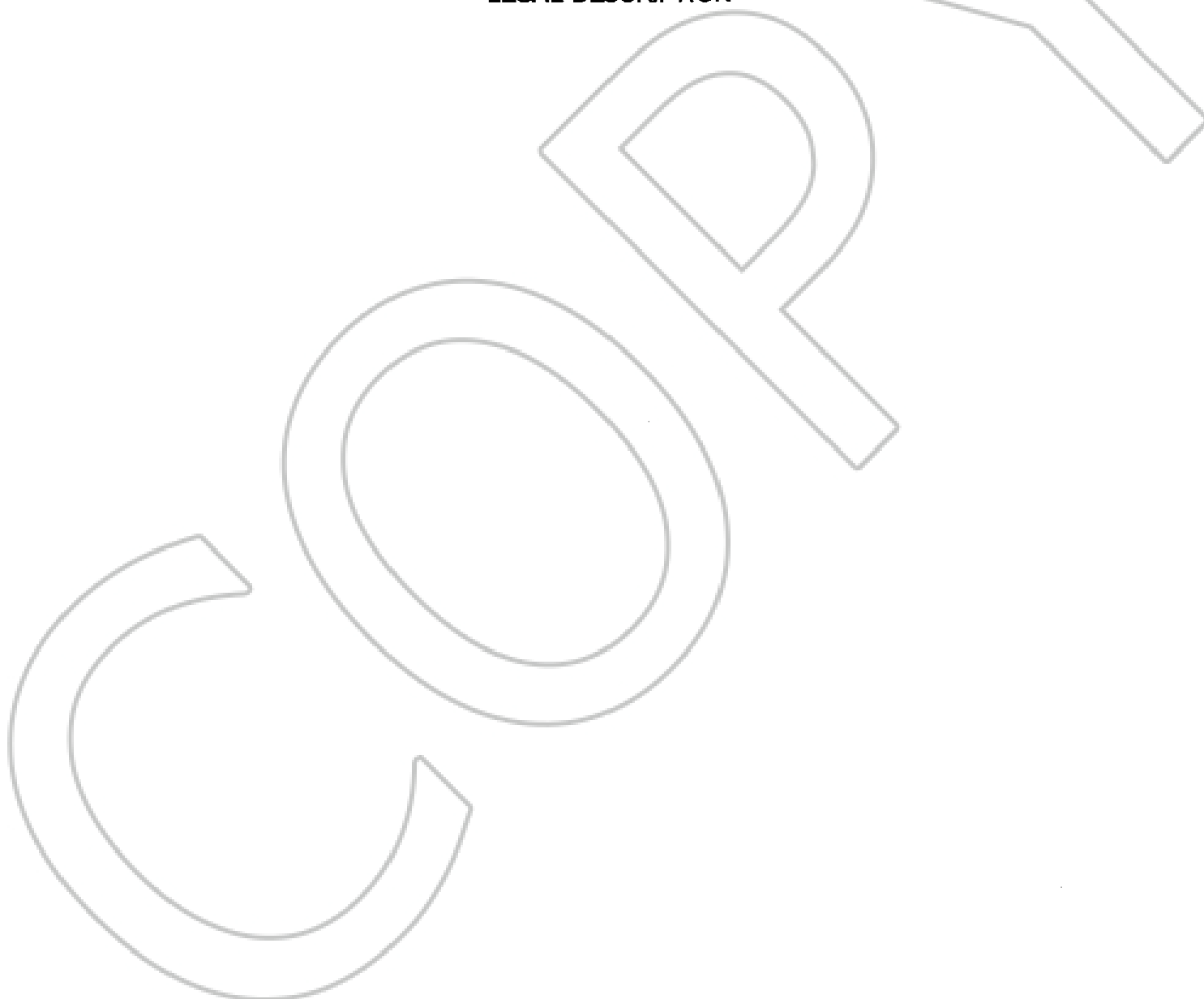
EXHIBIT "A" LEGAL DESCRIPTION

Property Address: 644 CARMEL WAY, GARDNERVILLE, NEVADA 89410