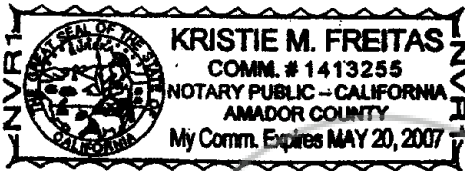
Place Notary Seal Above

proved to me on the basis of satisfactory evidence to be the person(s) whose name(s) is/are subscribed to the within instrument and acknowledged to me that he/she/they executed the same in his/her/their authorized capacity(ies), and that by his/her/their signature(s) on the instrument the person(s), or the entity upon behalf of which the person(s) acted, executed the instrument.