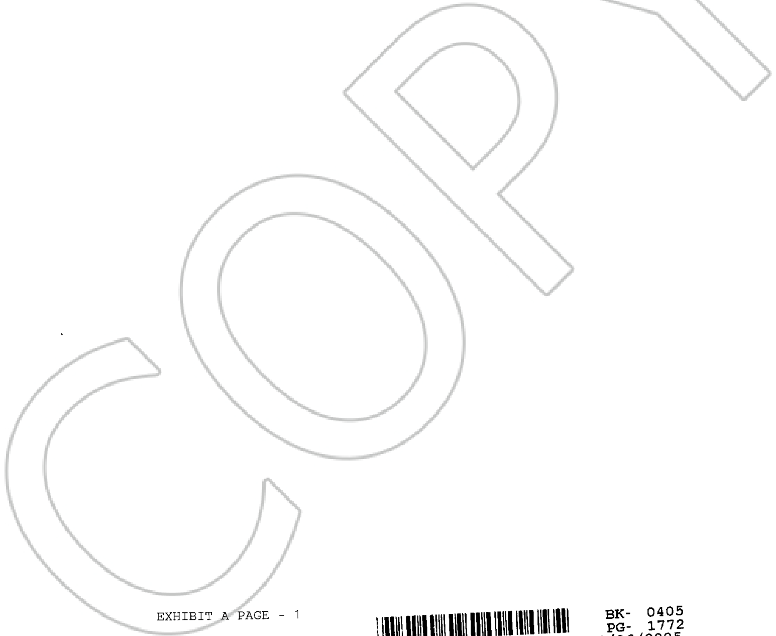
EXHIBIT A PAGE - 1