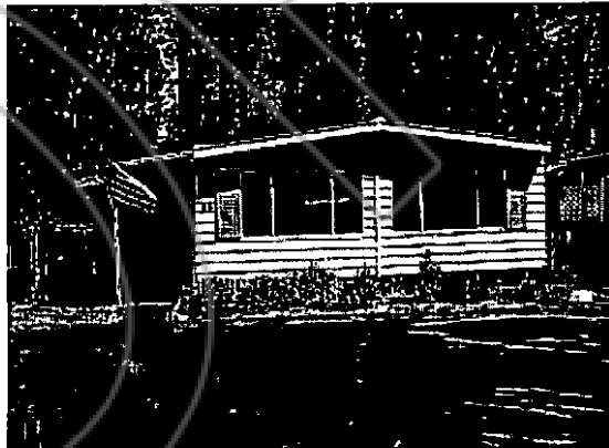
Photos do not necessarily depict the current appearance of the property.