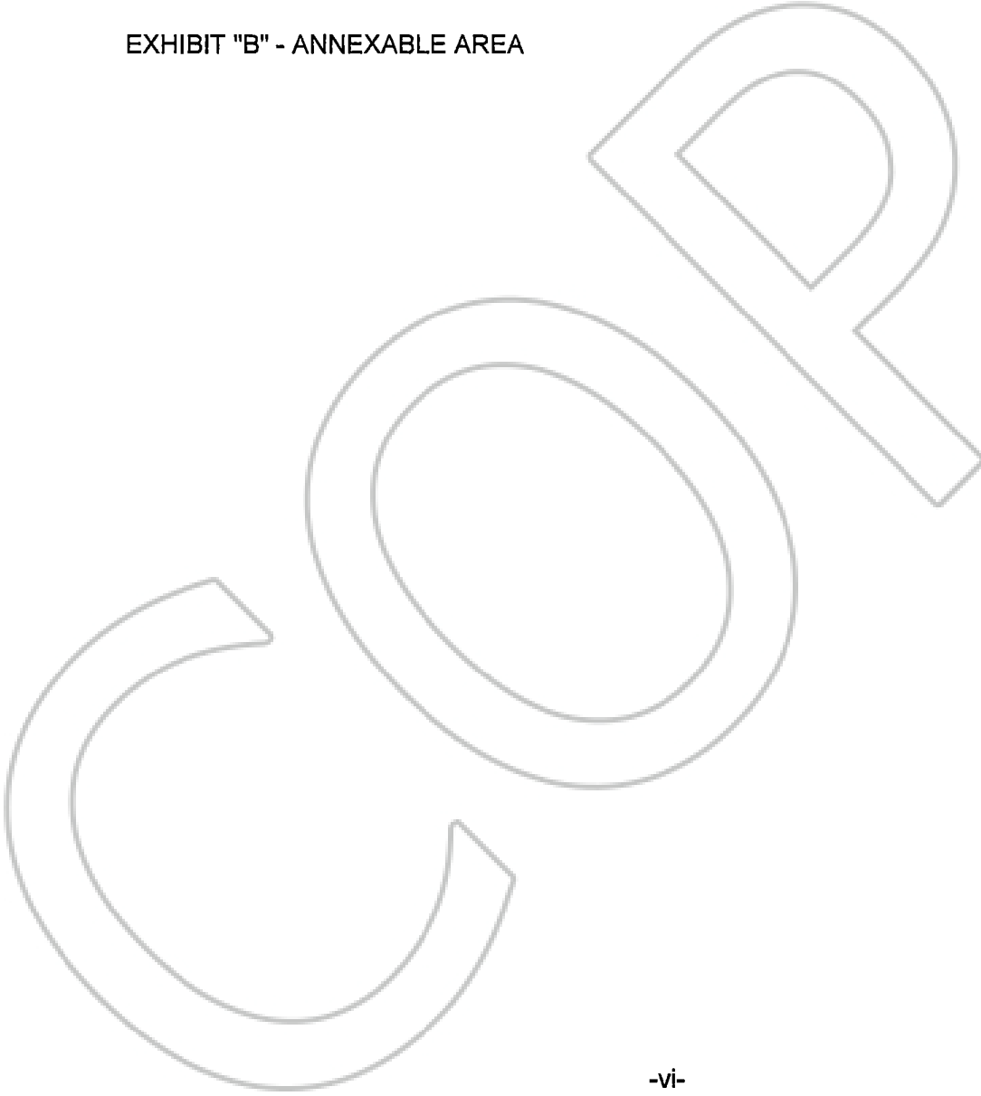
EXHIBIT "B" - ANNEXABLE AREA