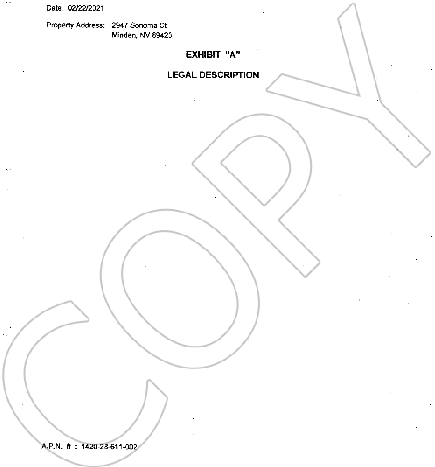
EXHIBIT "A" LEGAL DESCRIPTION

Property Address: 2947 Sonoma Ct Minden, NV 89423