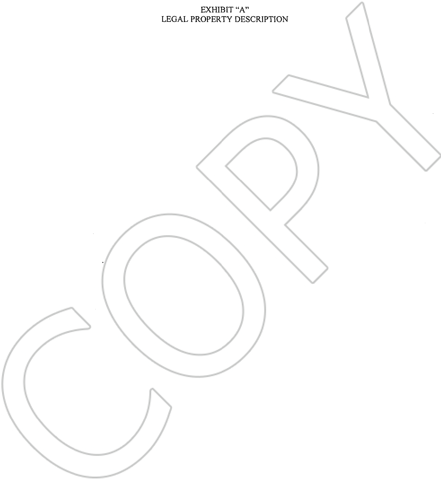
EXHIBIT "A" LEGAL PROPERTY DESCRIPTION