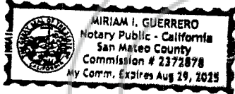
Place Notary Seal and/or Stamp Above

Signature [Handwritten Signature] Signature of Notary Public