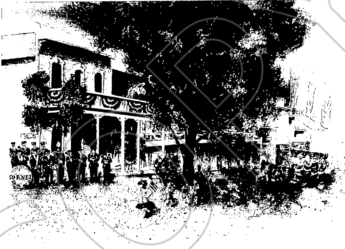
Main Street on Parade - 1900 Gardnerville, Nevada

Image of the artwork to be presented and the description