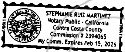
Place Notary Seal and/or Stamp Above

I certify under PENALTY OF PERJURY under the laws of the State of California that the foregoing paragraph is true and correct. WITNESS my hand and official seal.