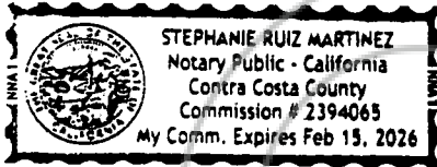
Place Notary Seal and/or Stamp Above

Signature [Handwritten Signature] Signature of Notary Public